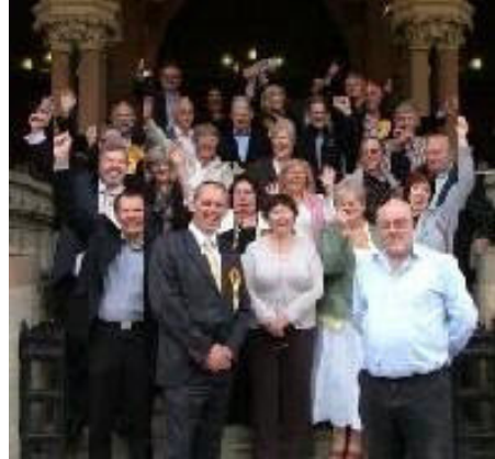
Northampton's Liberal Democrat Team

Since then they improved the management of the council by appointing a new management team, sorting out the finances and protecting front line services.